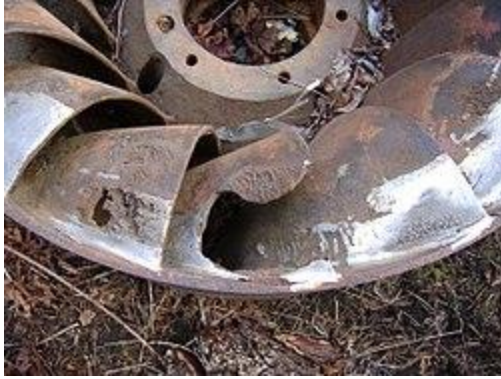
Cavitation damage to a Francis turbine .

Cavitation is, in many cases, an undesirable occurrence. In devices such as propellers and pumps , cavitation causes a great deal of noise, damage to components, vibrations, and a loss of efficiency. Cavitation has also become a concern in the renewable energy sector as it may occur on the blade surface of tidal stream turbines . [22]