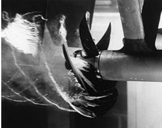
Cavitating propeller model in a water tunnel experiment.

For other uses, see Cavitation (disambiguation) .