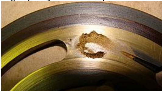
Cavitation damage on a valve plate for an axial piston hydraulic pump .