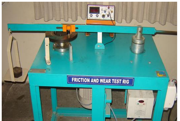
Fig 3 Pin on Disc Wear Test Rig

Influence of EGR (Exhaust Gas Recirculation) on Engine Components Durability & Lubricating Oil Condition