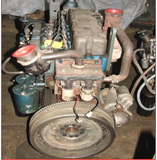
Fig 1. Engine with EGR System

Base engine was modified to incorporate an EGR system. The detail of the layout and experimental set up for EGR system is given in Fig 1 and Fig 2.