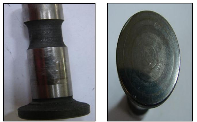
Fig 6 Wear Marks on outer diameter and bottom face of the Valve tappet.