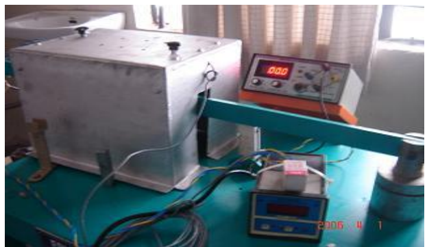
Fig 4 Pin on Disc Wear Test Rig with heating chamber