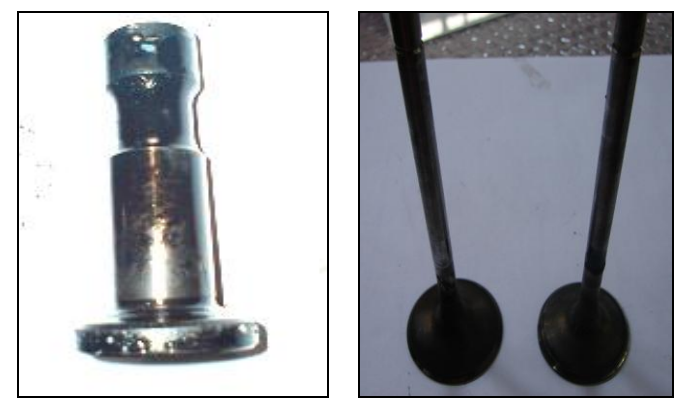
Fig 5 Carbon deposits on valve tappet and Valve

Influence of EGR (Exhaust Gas Recirculation) on Engine Components Durability & Lubricating Oil Condition